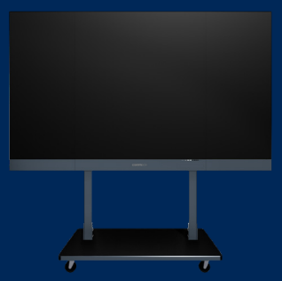
Instant signage or messaging anywhere