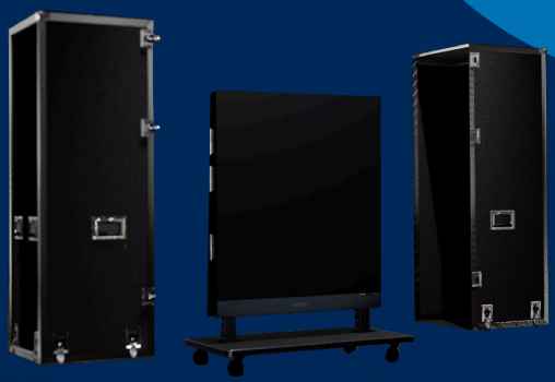
Effortless set-up and relocation