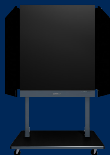
Cover all angles